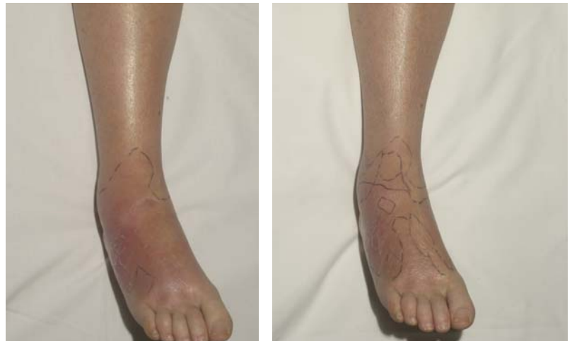
Mr A: Antibiotics and VIBRO-PULSE 100% cellulitis / oedema reduction day 4.