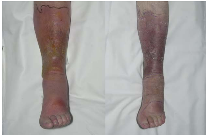
Mr B: Antibiotics and VIBRO-PULSE 100% Cellulitis / oedema reduction day 6.