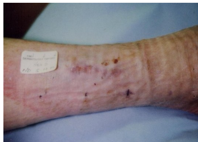
Right leg before and after 6 weeks VIBRO-PULSE therapy