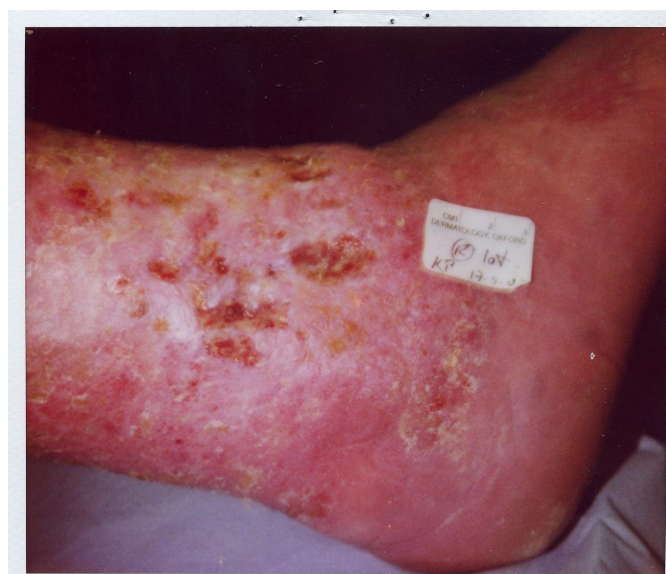
Left leg before and after 9 weeks VIBRO-PULSE therapy