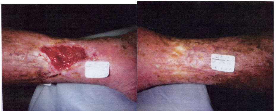
Right lateral and medial leg ulcer after 12 weeks VIBRO-PULSE therapy

SATISFACTION: Mrs B was pleased to finally see her ulcers improve.