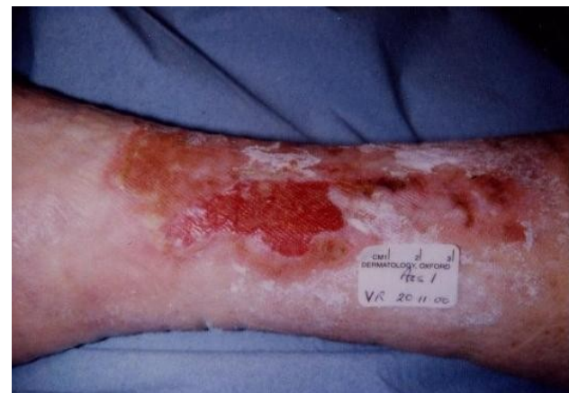
Left leg before and after 5 weeks VIBRO-PULSE therapy