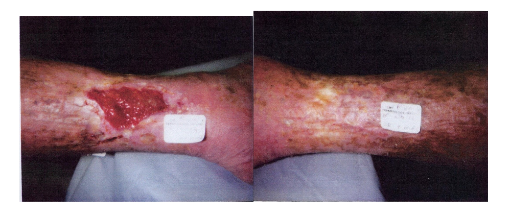
Right lateral and medical leg ulcer after 12 weeks VIBRO-PULSE therapy

SATISFACTION: Mrs B was pleased to finally see her ulcers improve.