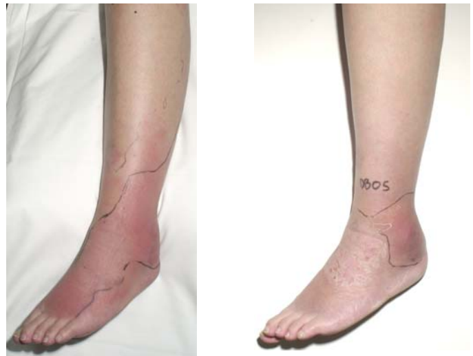
Mr H: Antibiotics and VIBRO-PULSE 75% Cellulitis / oedema reduction day 6.